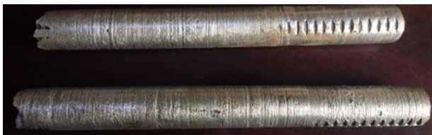
Figures 2: Samples after tensile testing