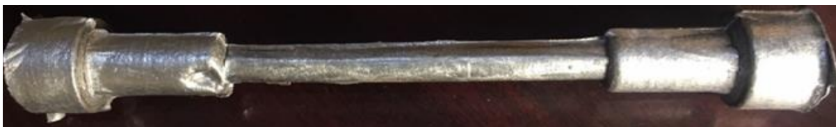
Figures 1: Samples after squeeze casting

Where; A - Pouring Temperature; B - Mold Temperature; C - Squeeze Pressure