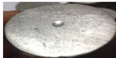
Figures 3: Samples after hardness testing

2.3 Taguchi contributions are the signal to noise ratio it was developed as a proactive equivalent to the reactive loss function. The tensile and hardness test were considered the quality characteristic of interest with the concept of "the larger the better". The S/N ratio used for this type response is given by equation (3)